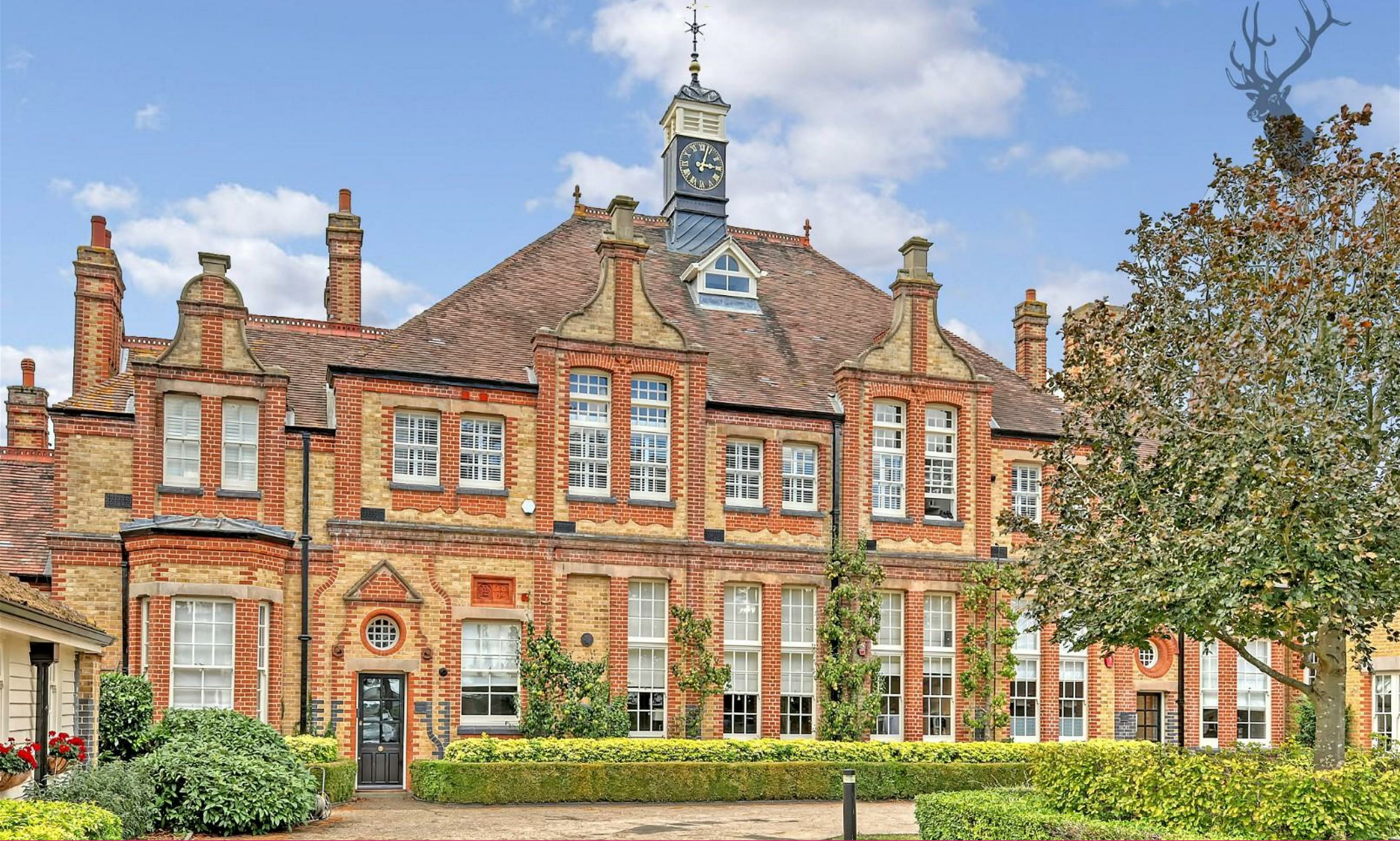
Elmbridge Hall, , CM5